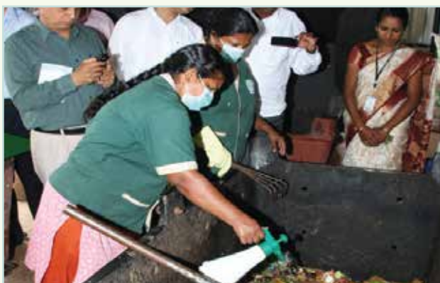
Applying Bio culture for processing