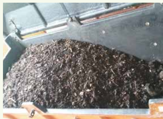
Compost Ready After 30 Days