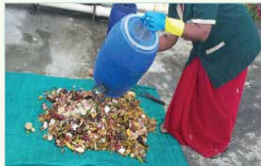
Final checking to ensure Segregation of waste