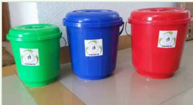
Bio degradable and Non-bio degradable waste segregated in separate buckets for door to door collection.