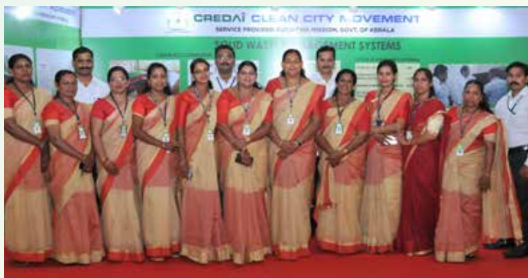
2016 CREDAI Clean City Movement team.

CCCM vehicles for the collection of Non Bio Degradable waste.