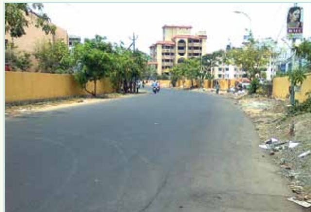
View of the road tarred using plastic in Ernakulam.