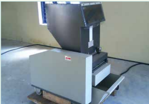
Plastic Shredding Machine.

CREDAI CLEAN CITY MOVEMENT along with Corporation of Kochi is operating a Plastic Shredding Unit. Plastic collected from apartments is shredded and used for tarring the roads. The plastic when used for road tarring helps in reducing the consumption of Bitumen and also enhances the life of roads.